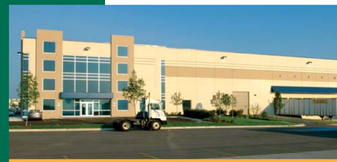
Minooka Distribution Center #2 Minooka, Illinois

Zoning for a full range of uses and a fast-track approval process